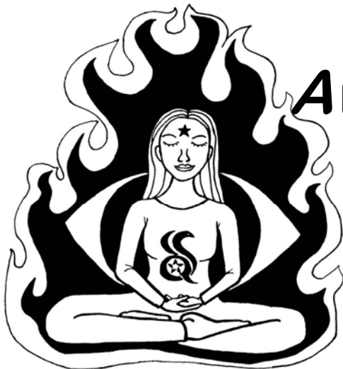
Awakening Our Dreams, Igniting Our Reality Spring Quest 2006