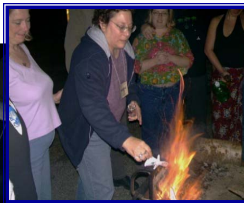
Kestrel tosses the poppet into the fire!