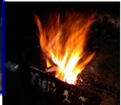
The magick of the poppet is released for another who is in need!