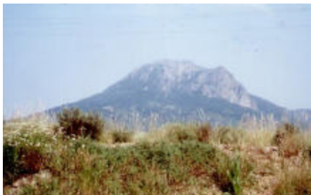
3. Into the Hills

valleys surrounding the church were in full bloom with flowers in my favorite shade of yellow.