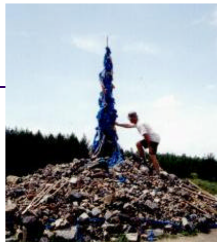
Roger Dinger placing blue feather in Mongolia