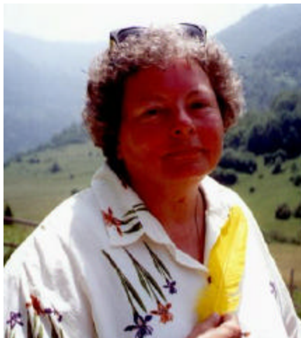
5. Yellow feather before the climb

climb up to the ruined castle as difficult and steep, and it was. I had brought the feather with me since this seemed like the right place to leave it [pic 5]. It was very hot (over 90 degrees) and I climbed the trail very slowly. It was lined with boxwoods, rocky with occasional steep wooden steps. About 3/4 of the way up, I realized I didn't