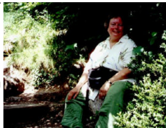
6. East feather's resting place

Our last stop was Montserrat, a rocky formation near Barcelona in Spain. Montserrat has a black Madonna that was found in a cave; she refused to leave the mountain so a basilica was built for her. She's a wooden statue with Jesus sitting on her knee. Both figures face straight forward; she holds a globe in her right hand. She sits high above and behind the altar (about where the baptismal tank sits in many Baptist churches). There are back stairs which lead up to her place and people pass by her in a constant stream touching the globe which is the only part of her that sticks out of her glass case. It's bizarre to sit in the church and watch the stream of people moving past her.